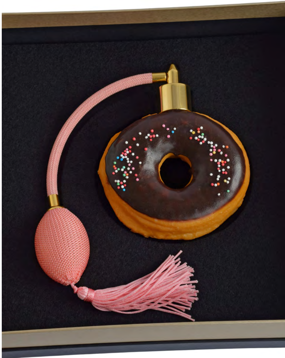
too good to be true from the series "biedermeier for advanced users" illusionary object pvc, sugar, fabric, felt, cardboard, brass approx. 21 x 21 x 7 cm (size box) 2020

theme: neo-biedermeier, cocooning, homing, arcadia, displacement activity