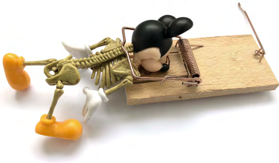
PSP gives a damn sculpture pvc, acrylic paint, mousetrap approx. 23 x 7 x 5 cm 2019