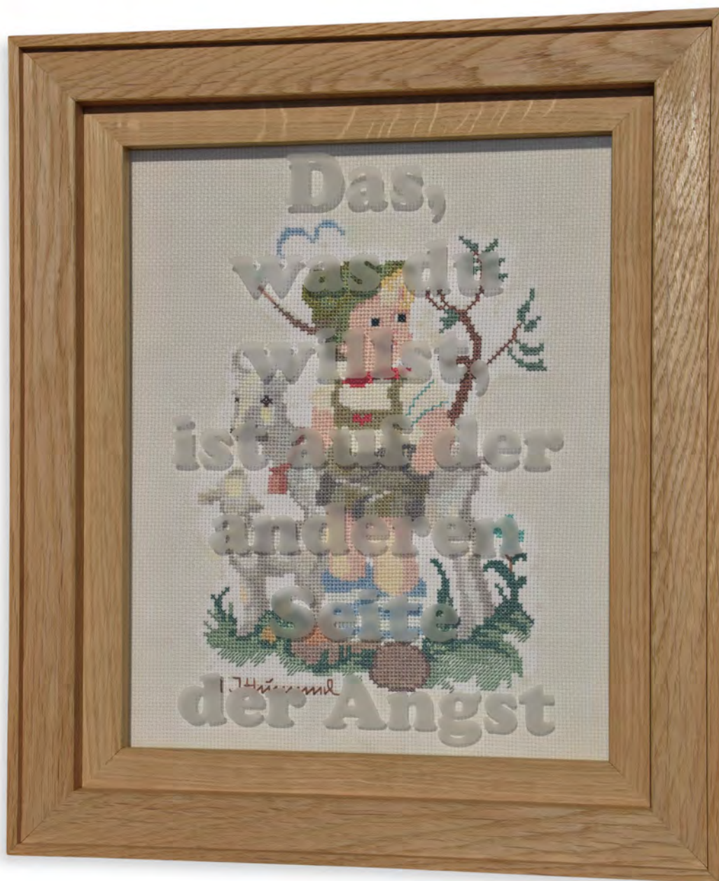
das, was du willst wallpiece fabric, wool, sandblasted glass, oak approx. 39 x 33 x 5 cm 2020